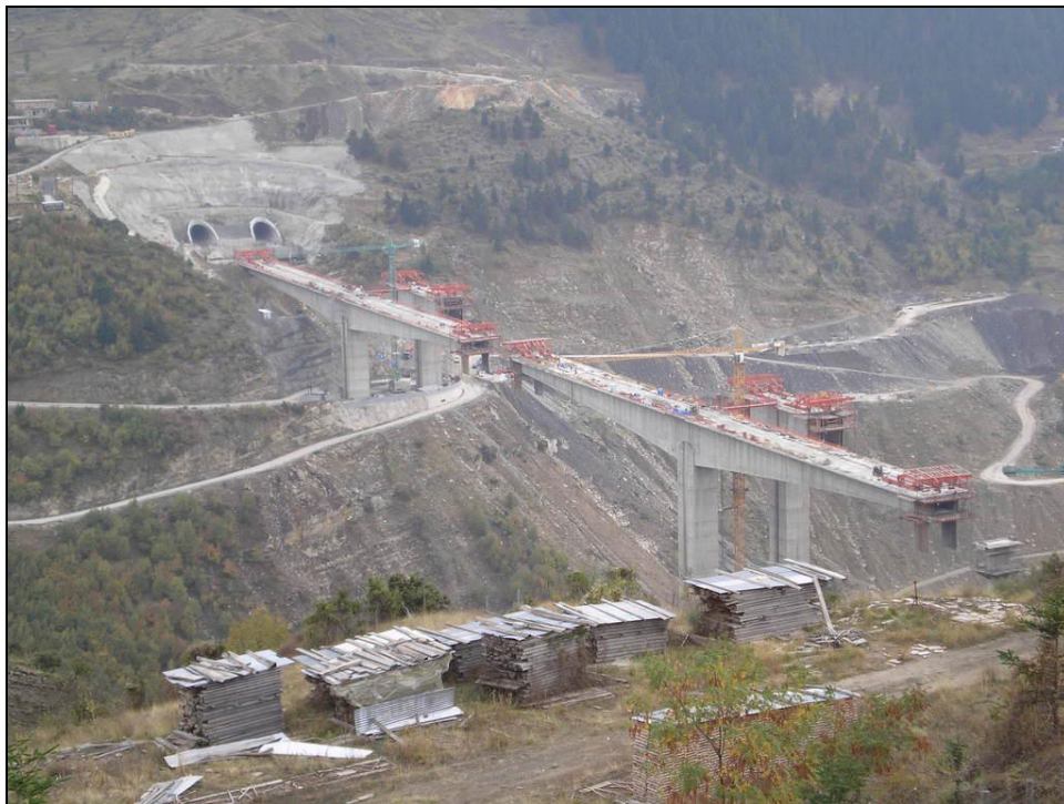
Figure 2: Balanced Cantilever Construction Metsovitikos Bridge, Greece

The Juneau Creek bridge options that use cantilever construction are the post-tensioned concrete box girder and the cantilever steel truss bridge.